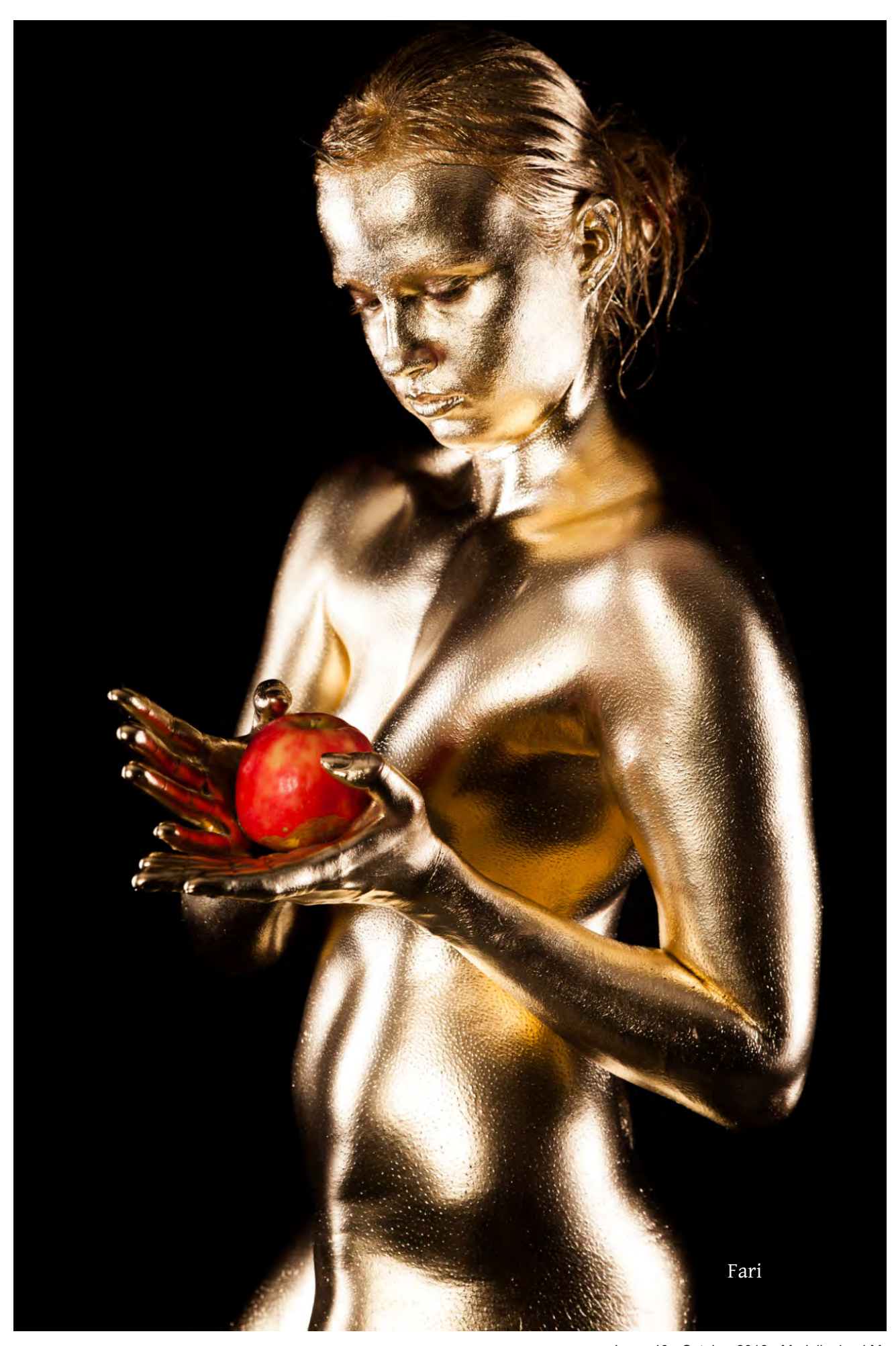
Issue 40 - October 2018 - Modellenland Magazine