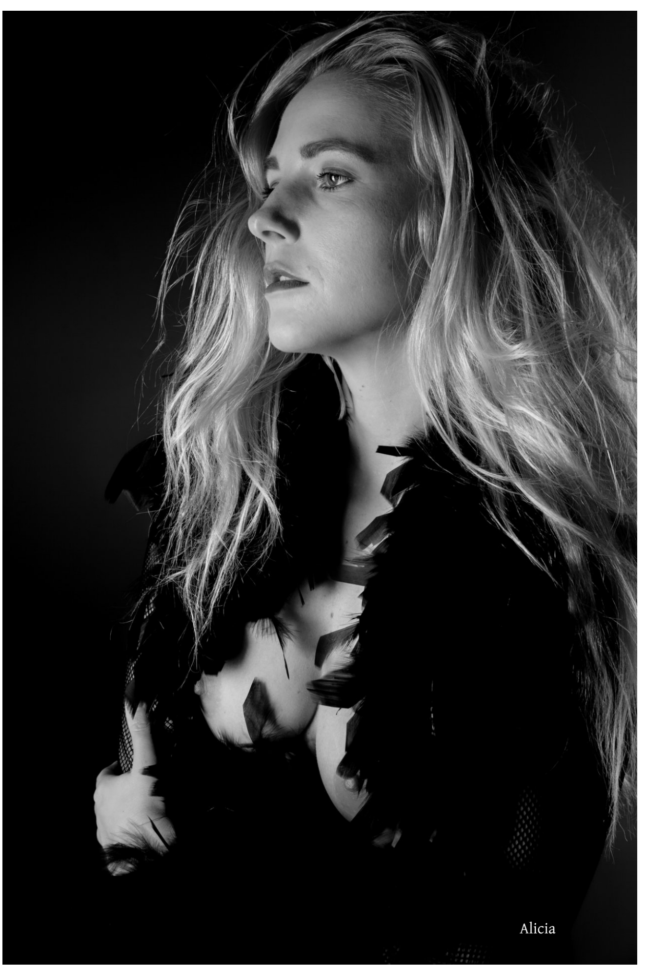
Issue 40 - October 2018 - Modellenland Magazine